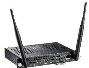
OPS3-i5-TPM & OPS3-i7-TPM

Optoma offers optional full-fledged PCs with Intel Core i5 and i7 processors that slot into the Creative Touch IFP and enhance the computing. Operating system not included. Compatible with Microsoft Windows 11.