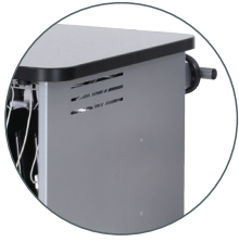
DURABLE, HEAVY-DUTY CONSTRUCTION