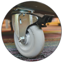
DELUXE LOCKING BALLOON WHEELS