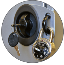
DUAL-BOLT LOCK AND HASP (PADLOCK NOT INCLUDED)