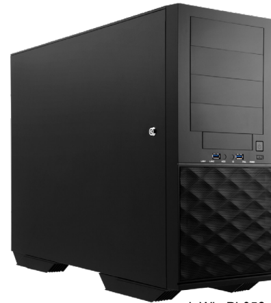
InWin PL052 Chassis