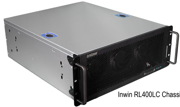
InWin RL400LC Chassis