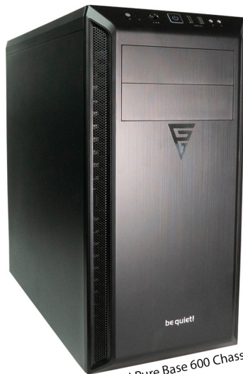
Be Quiet! Pure Base 600 Chassis